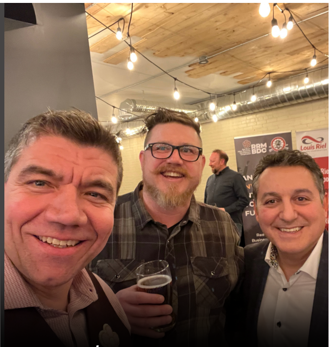
January 10/25 - Obselete Brew Pub, Dauphin